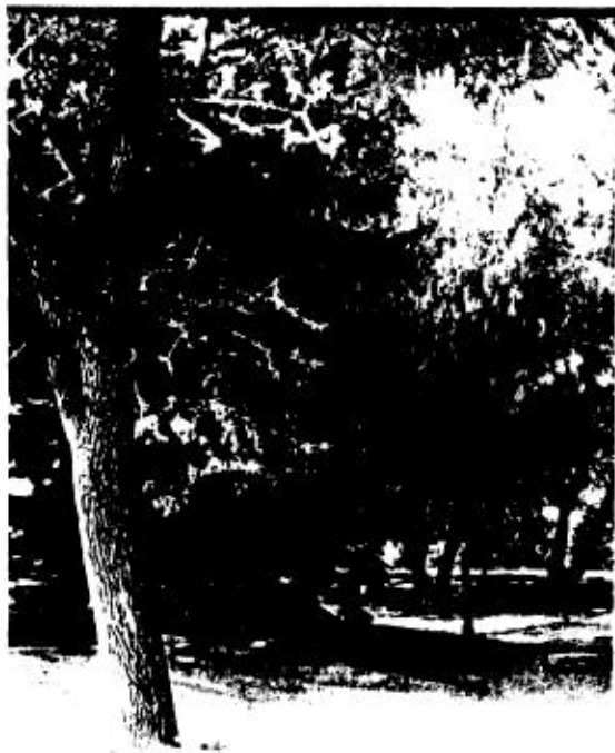
GIANT SPRINGS - Great Falls, Montana